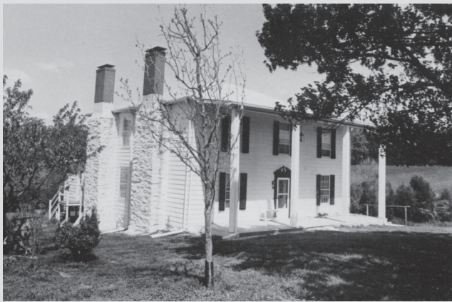
Whistle Stop