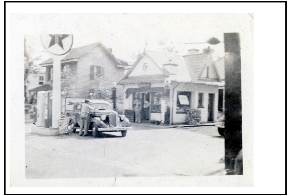
Craun Brothers' James Madison Texaco Station on the site of the Orange County Historical Society, ca. 1940

As we look forward to 2025, we would like to increase the number of members who volunteer. What would interest you? Ideas are very welcome! Stay tuned to the "Oracle" for 2025 volunteer opportunities.