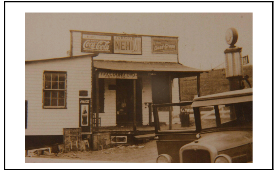
General Store at Raccoon Ford Post Office, ca. 1925